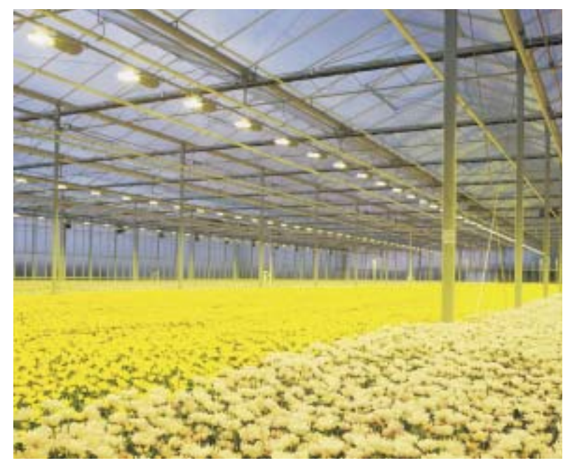
The most used lamps for supplementary growth lighting are high pressure sodium lamps.

example, is important for good plant development and the correct regulation of the stomata. A shortage of blue light and a relatively high proportion of far-red light cause excessive stem growth and